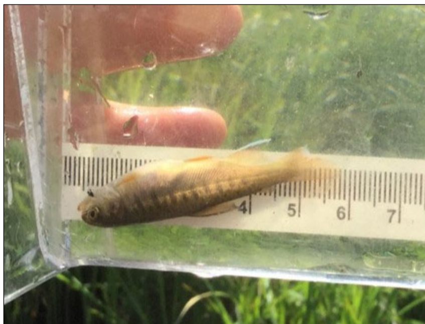
Figure 1.—Juvenile coho salmon captured at waypoint 828.