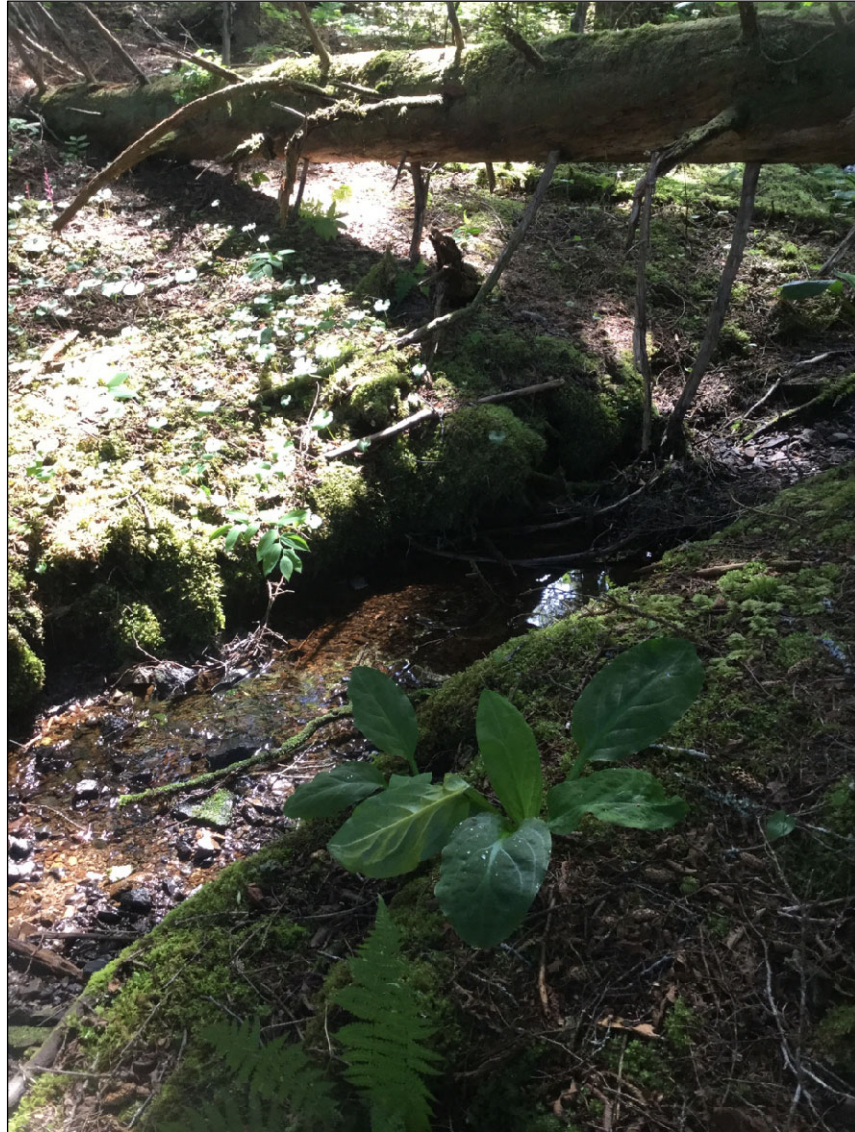
Figure 2.—Gravel channel of secondary tributary at waypoint 827.